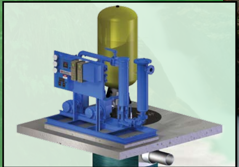
Typical System In Building Basement