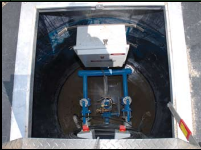
Packaged pump system for large waste transfer station using rain runoff water for truck cleaning.